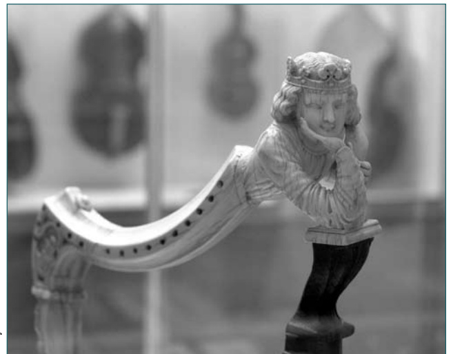
A Gothic revival ivory harp in the Yale Collection.