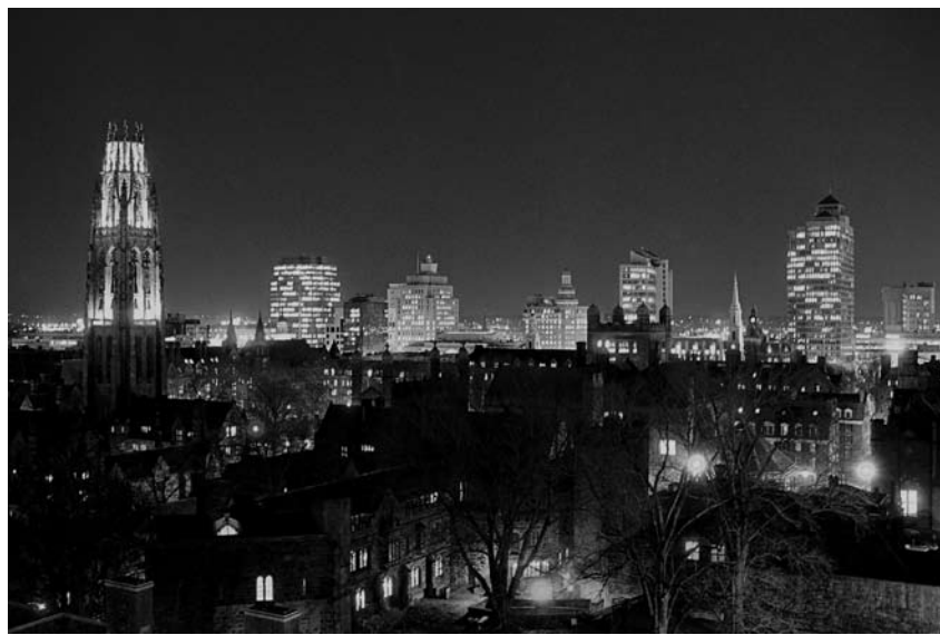
Yale campus at night.

A total of 53 papers has been selected for presentation by organologists and instrument enthusiasts from as far away as Turkey, Australia, and Japan. Presenters will also hail from Canada, France, Germany, Italy, Sweden, Switzerland, the United Kingdom, and the United States. In general, the paper sessions will follow a chronological path from